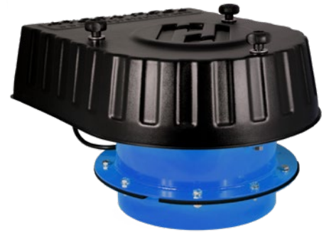
Control panel weather shield