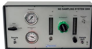
UT-3000 NG mobile component: Natural Gas Sampling System NGSS 3000