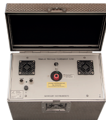
Manual calibration unit for the UT-3000 NG mobile