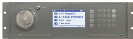
UT-3000 NG mobile component: Mercury Ultratracer UT-3000

The System comprises the well proven photometer unit UT-3000 Ultratracer and the Natural Gas Sampling System NGSS 3000 for sample conditioning.