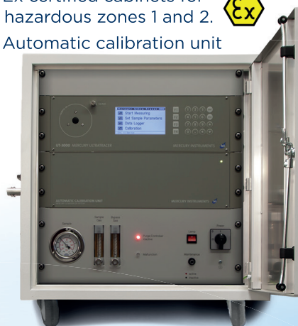
UT-3000 NG mobile with automatic calibration unit and Ex certified housing

Product developed and manufactured in Germany by: