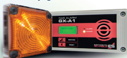
UT-3000 NG mobile: gas alarm